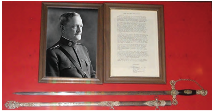
John J. Pershing's Knight Templar Sword.

be a rather non-descript sword of Nebraska regulation, some letters, a photo, and two brass plaques. On closer inspection, the curious will find that this particular sword bears the name of one of this nation's great military heroes, General John