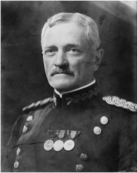
General of the Armies John J. Pershing