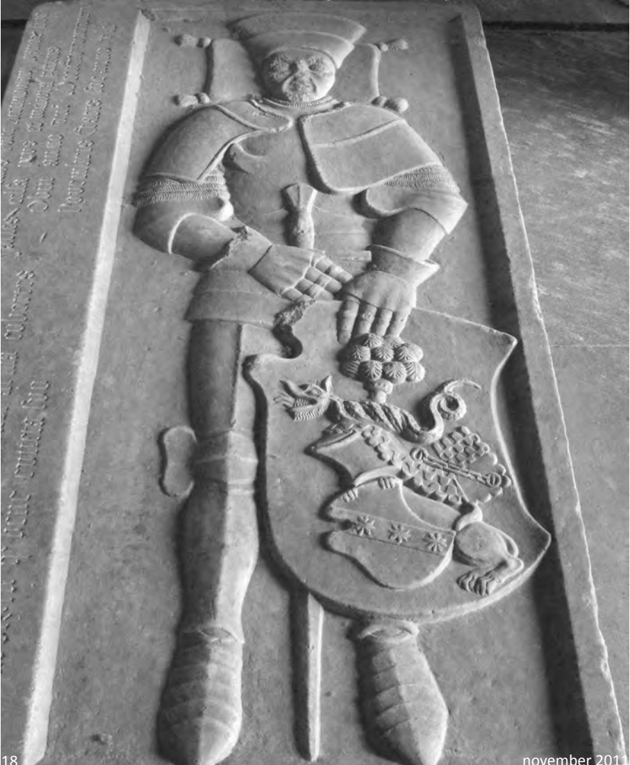
Tomb of an Italian Knight in Milano, Italy.

The space on these two pages is provided by the Knight Templar magazine to be used by the Grand Commanderies to communicate with the individual Sir Knights in their jurisdictions on a monthly basis. From time to time and for various reasons, we fail to receive any material from the editor of the state supplement for a given month. When this happens, we take the opportunity to offer you the information below. – The Ed.